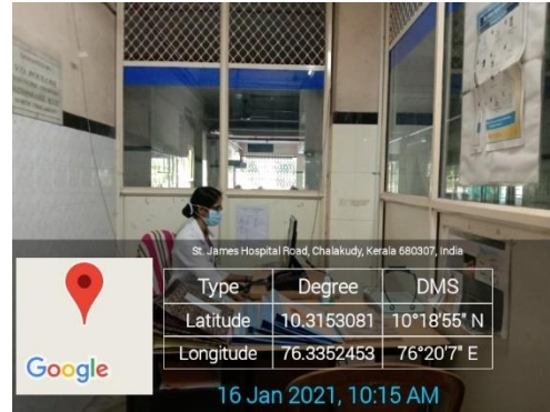
Computer facility in DIC