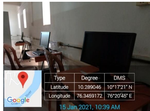
Computer facility in College library