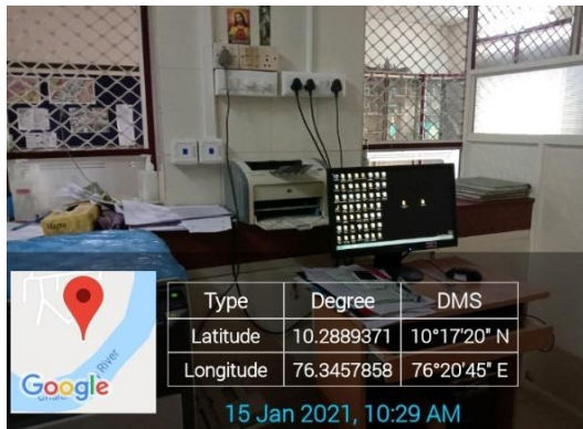
Computer facility in Office