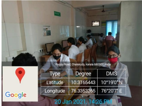
Computer facility in Dept Library