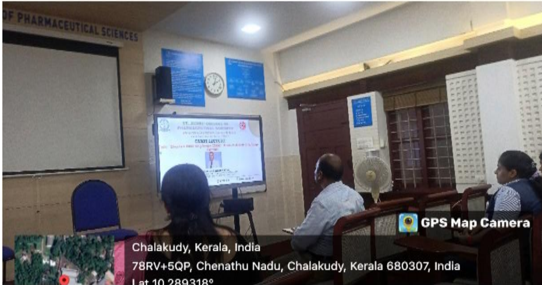
Chalakydy, Kerala, India 78RV+5QP, Chenathu Nadu, Chalakydy, Kerala 680307, India Lat 10.289318°