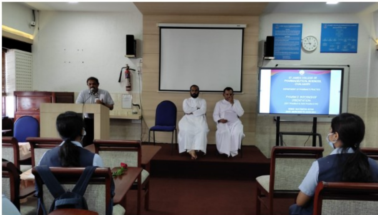
Internship Orientation Programme