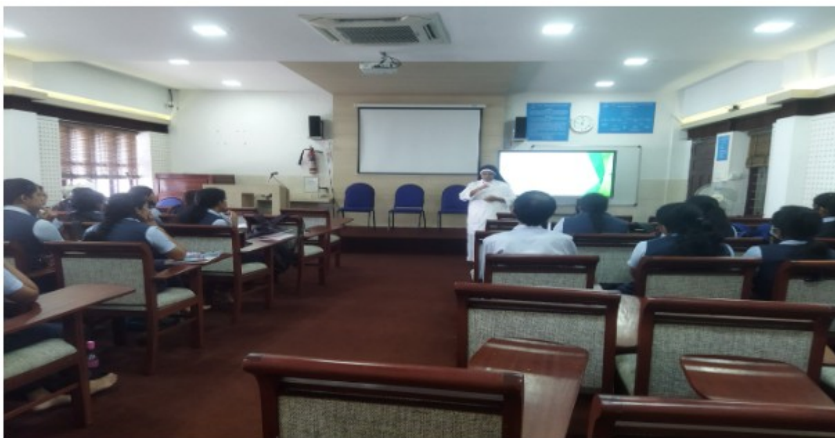
Internship Orientation Programme